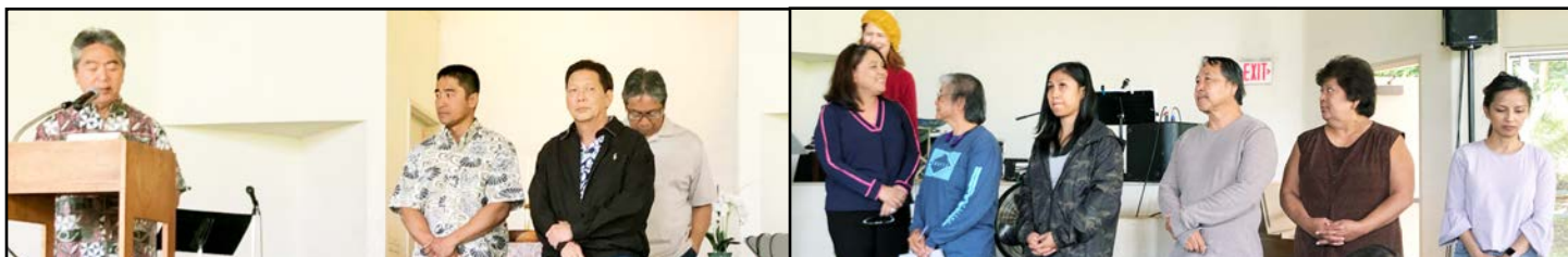
Renewing council members and new committee members take the stand at our annual congregational meeting.