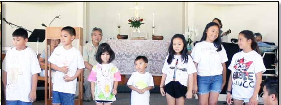
"Superstar" Vacation Bible School held from August 16th through August 18th