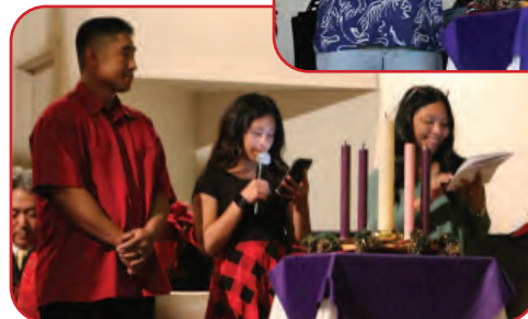
CHRIST Sagaysay Family