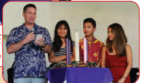
LOVE Rosenbush Family