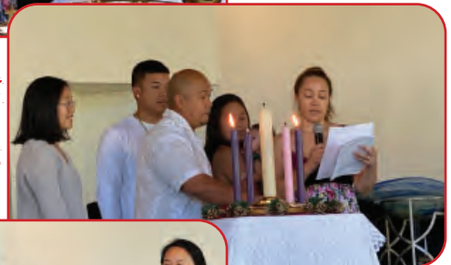
PEACE Galaro Family