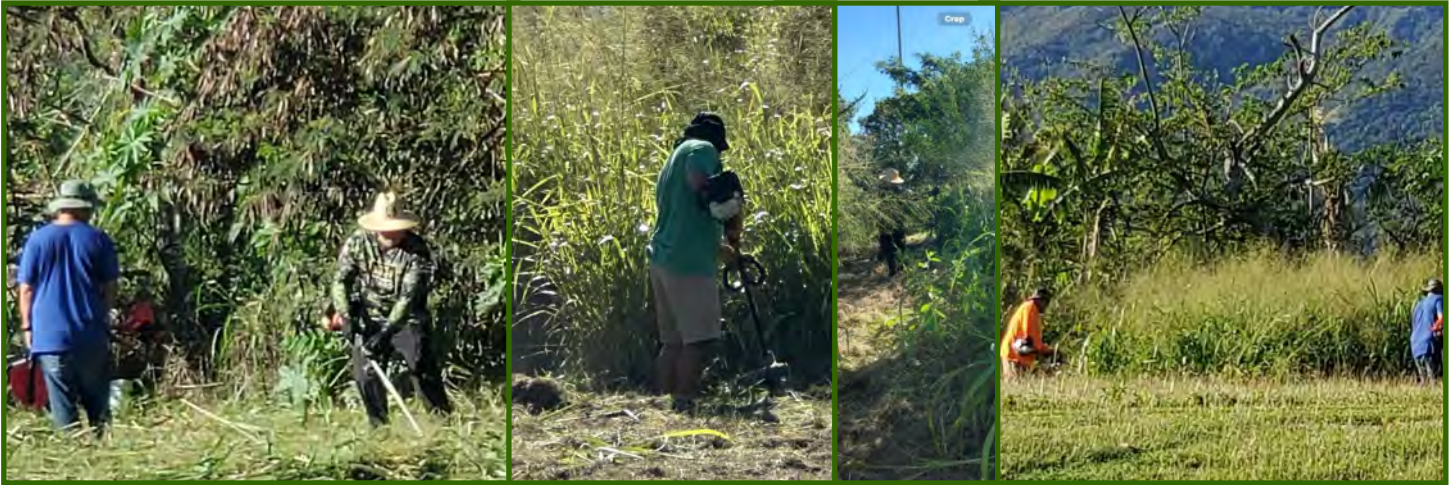
Weed whacking the overgrowth...