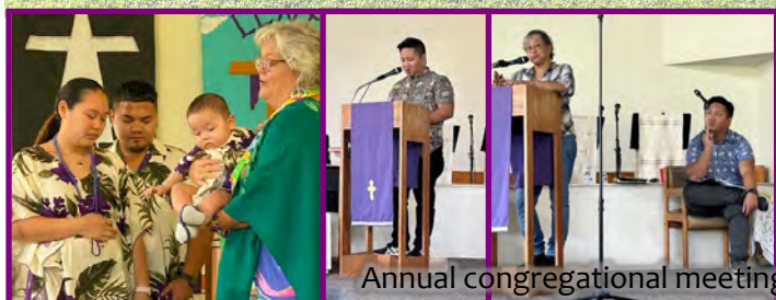
Annual congregational meeting...