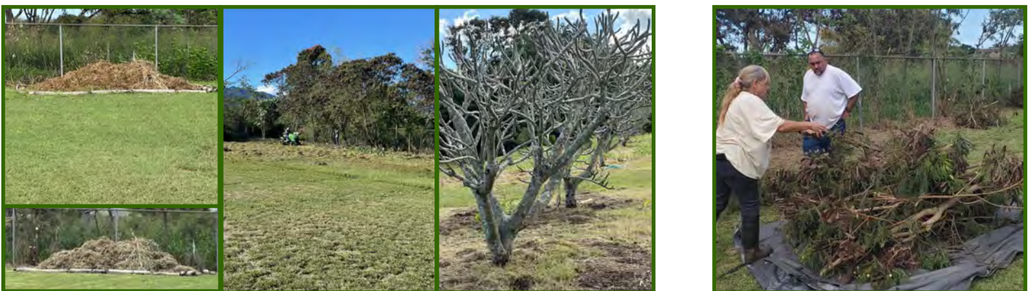
Starting a compost pile...