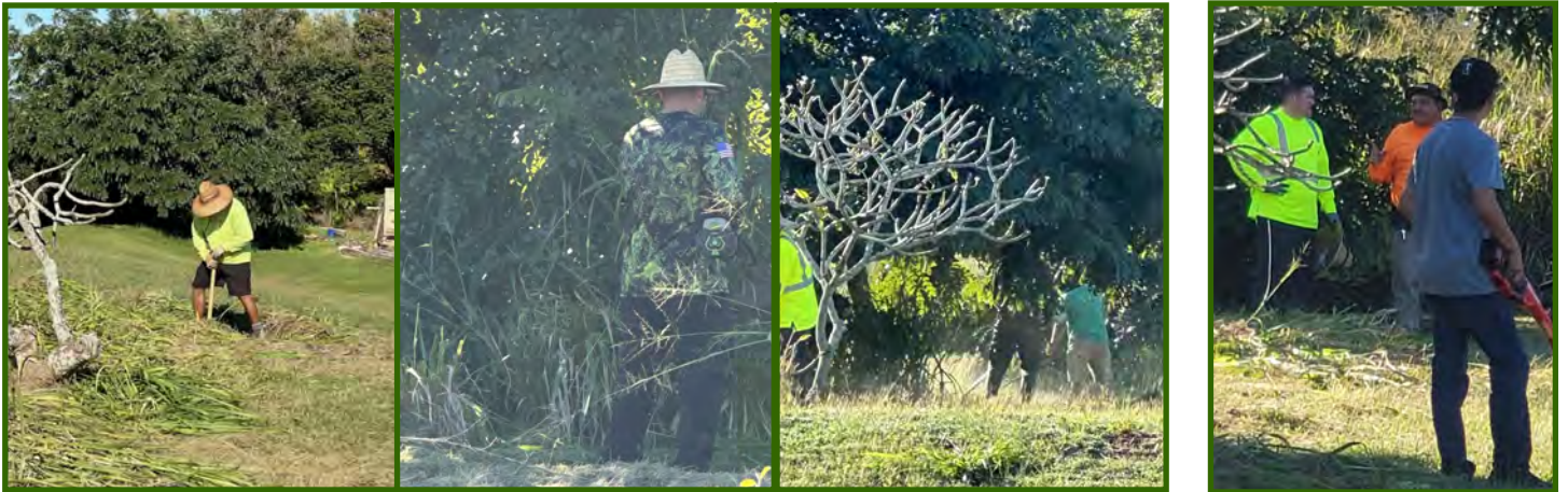
Digging the roots out...