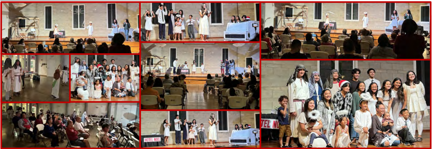
The Sunday School Program shines during their Christmas Play: "Hotel Noel"...