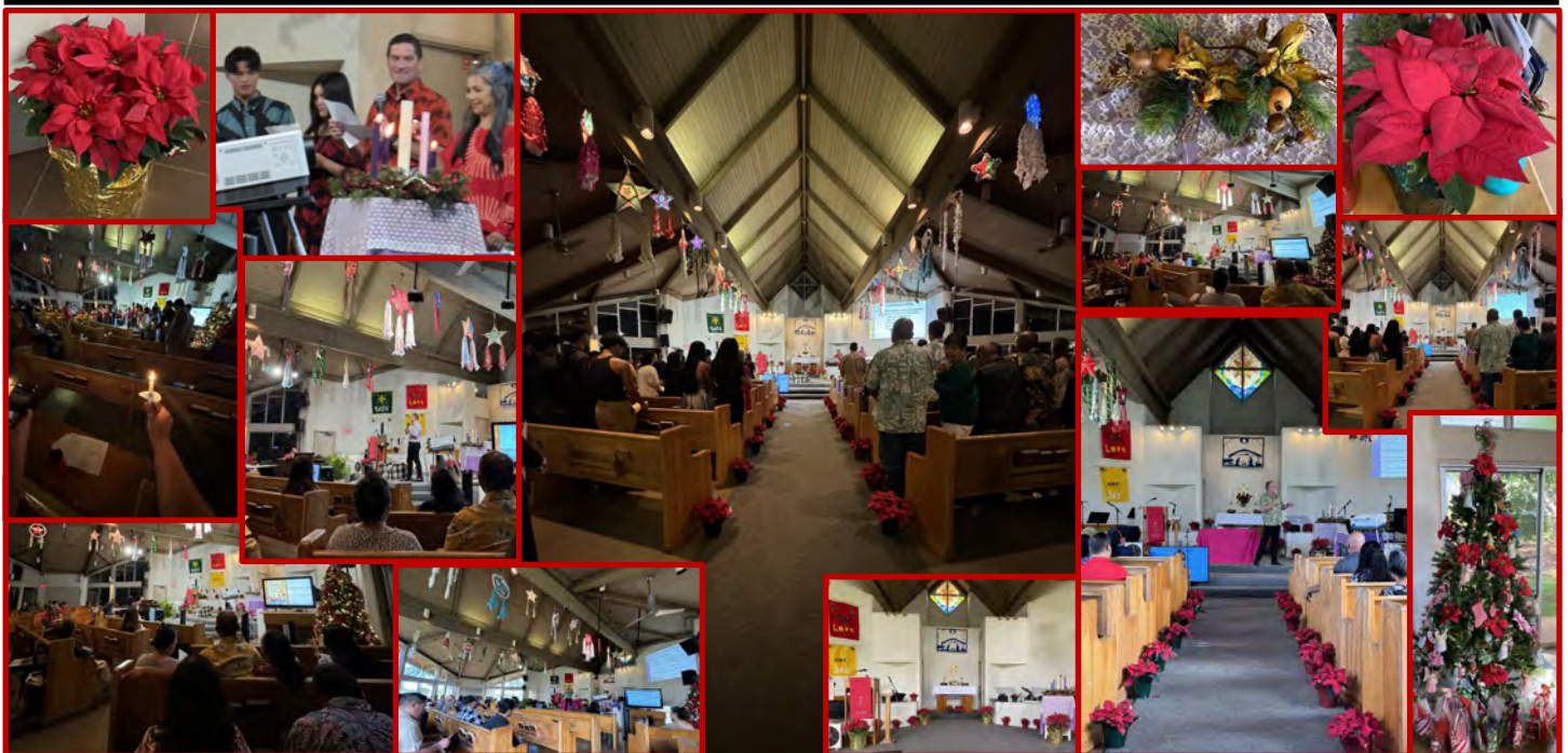
The Advent Season brings so much hope, peace, joy, and love...