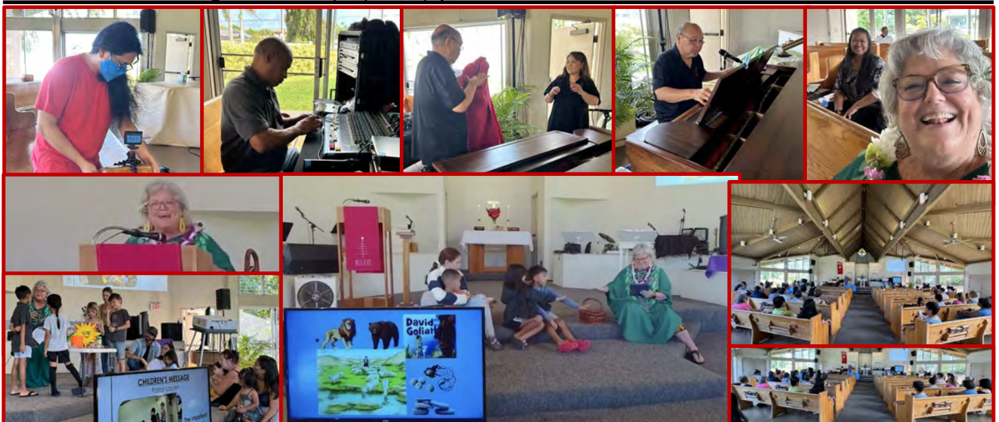
Every service is gifted with many talents from what's behind the scenes to what's presented to you...